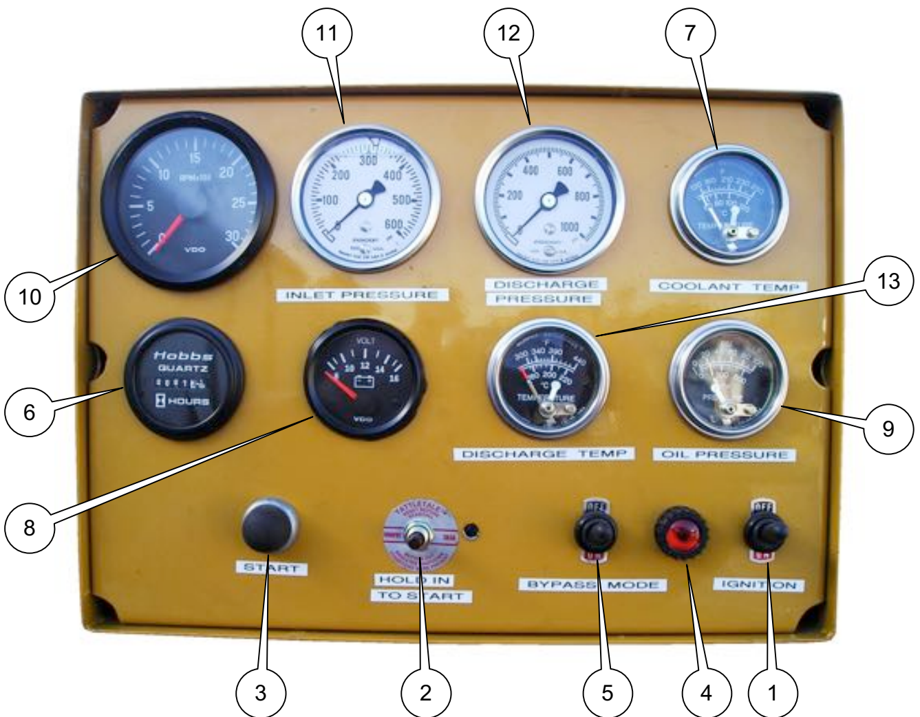
OPERATORS CONTROL PANEL