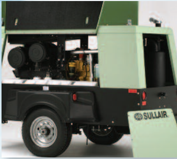
Total Accessibility Routine maintenance is simplified.